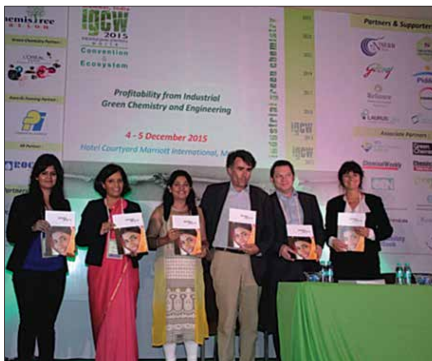
Award winners of 2015